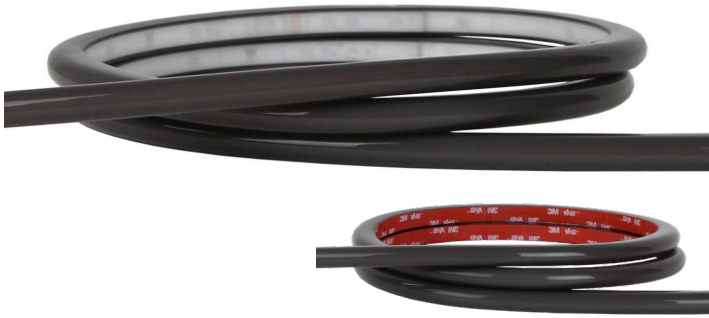
Luna Eclipse w/ Tape